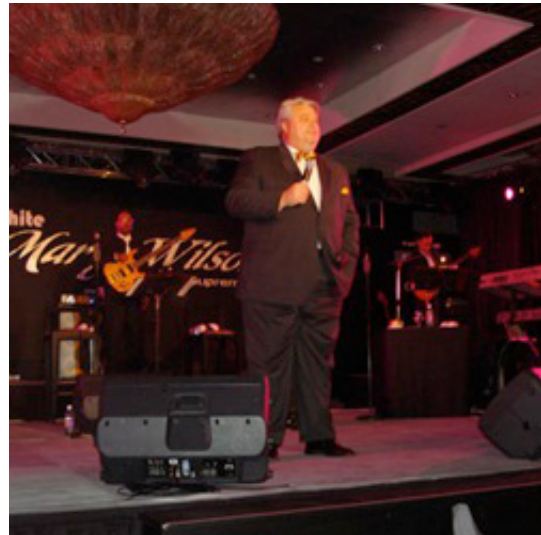
President HDI Ralph Cwerman address the crowd

In September, the Land O'Lakes (LOL) team made good progress as it selected its first batch of 363 farmers in 32 cluster areas. Extension Officers continued both classroom and field training. Fifteen cluster trainings for 150 farmers were completed in September as well as initial situational assessments with livestock cooperative societies. LOL also helped to restart the pasteurization