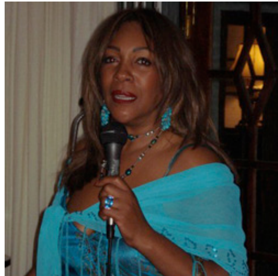
Singing at the reception